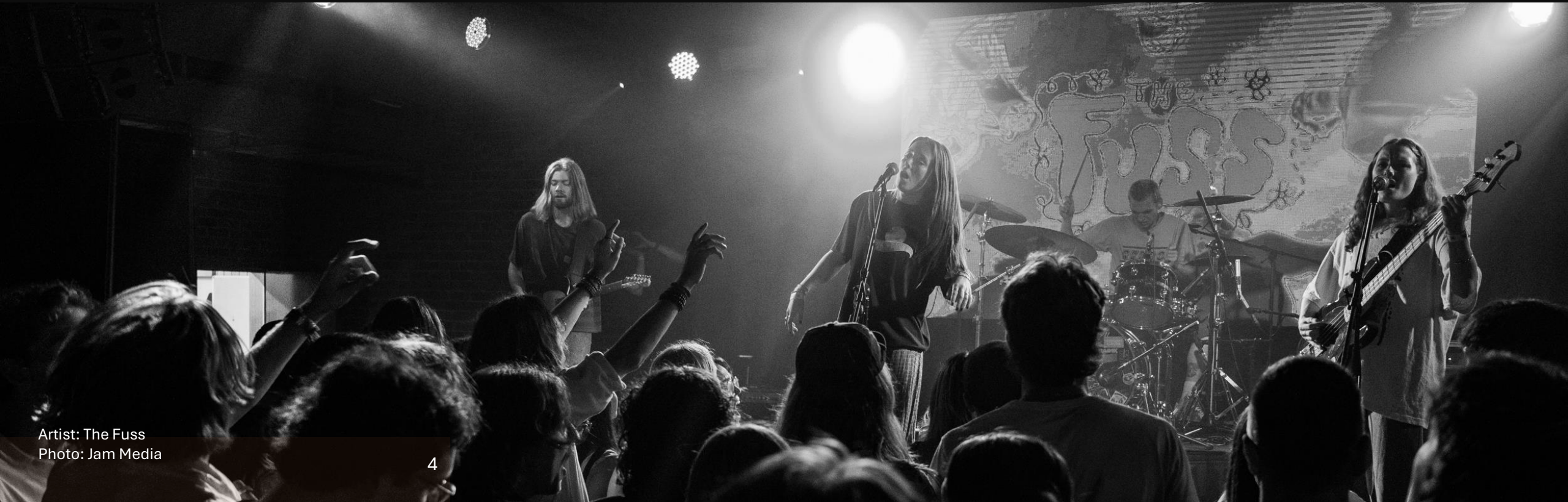
Artist: The Fuss

UniBar's license now extends outside of the building, taking in the Cloisters and lawn areas, home to many a fabled live music experience in its beautiful urban amphitheater setting including O'Ball dating back to the 80s, IndieFest 500, South Australian Music Awards, Adelaide Fringe and part of the home of the first Big Day Out in Adelaide.