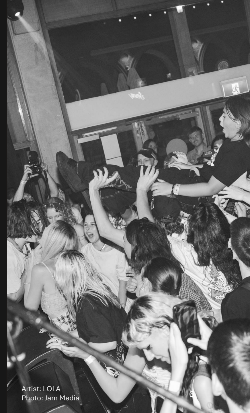
Artist: LOLA