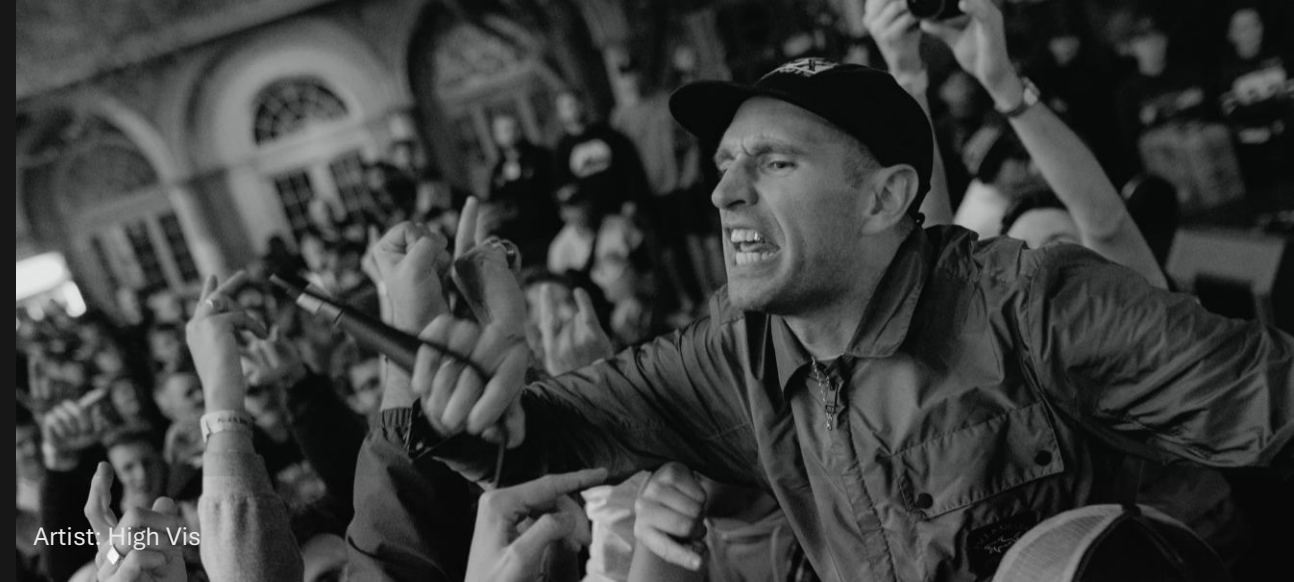
Artist: High Vis