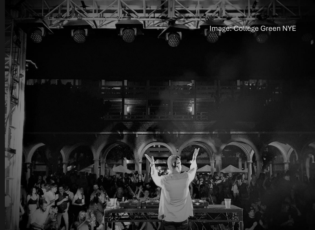
Image: College Green NYE