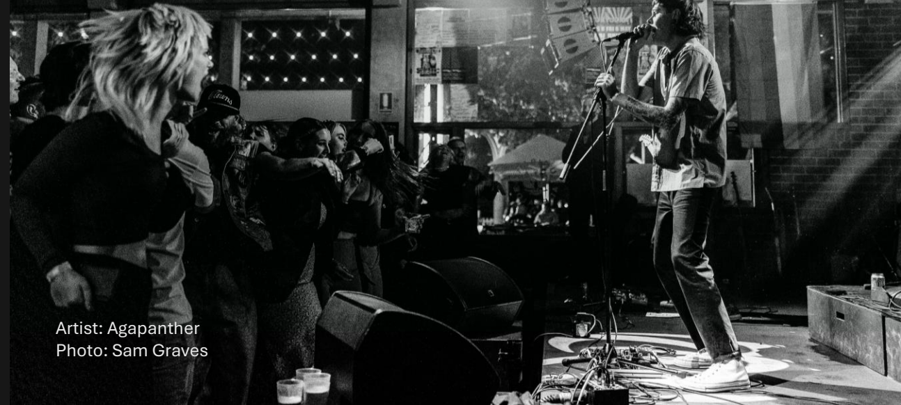
Artist: Agapanther