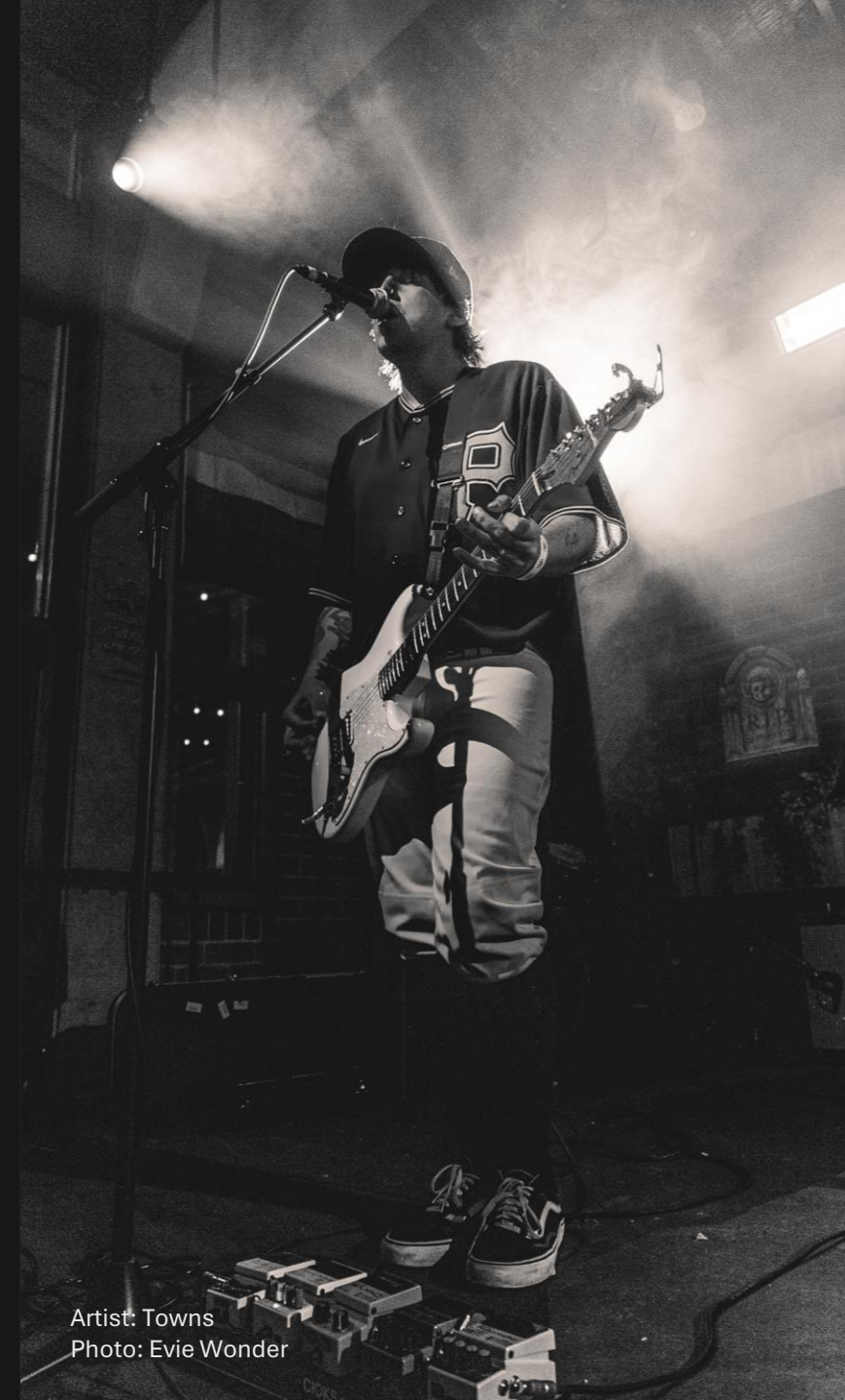
Artist: Towns