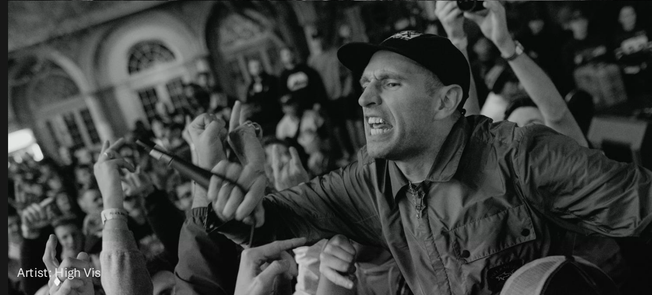
Artist: High Vis