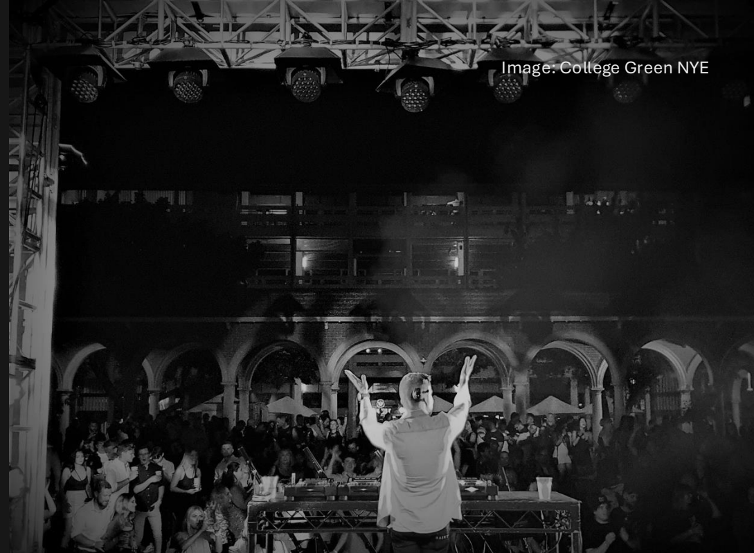
Image: College Green NYE